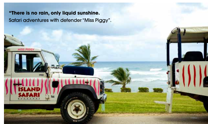
“There is no rain, only liquid sunshine.” Safari adventures with defender “Miss Piggy”.