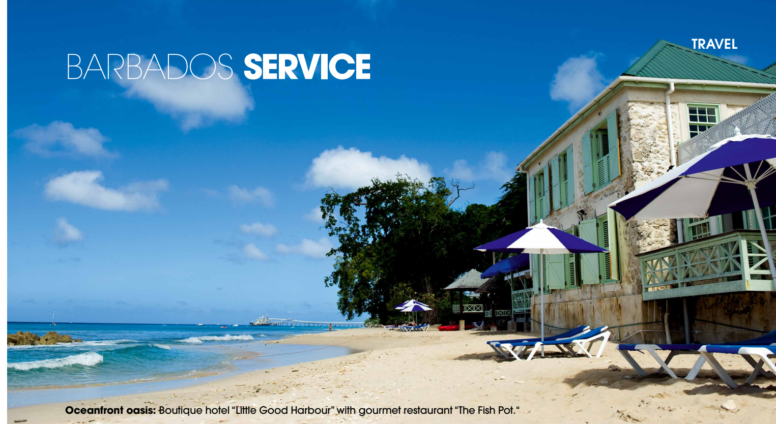
Oceanfront oasis: Boutique hotel “Little Good Harbour” with gourmet restaurant “The Fish Pot.”