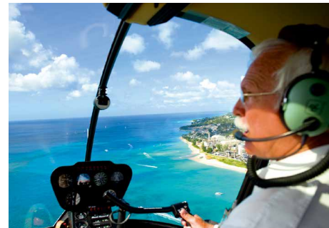
Heli adventures with professional sightseeing flights.

Begin the relaxation with a relaxing island tour: Friendly guides tell beautiful stories. Present hotspots and rumble through the Barbados forest. Very Land Rover! CWTS Complex, Salters Road Lower Estate, St. George Barbados, West Indies T. +1 246 429-5337 Fax: +1 246 429-8147 www.islandsafari.bb